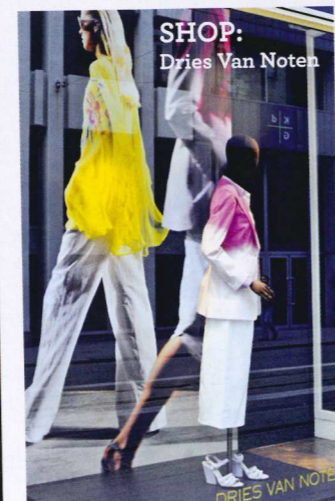
SHOP: Dries Van Noten