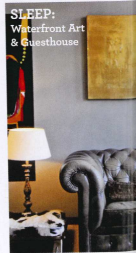
SLEEP: Waterfront Art & Guesthouse