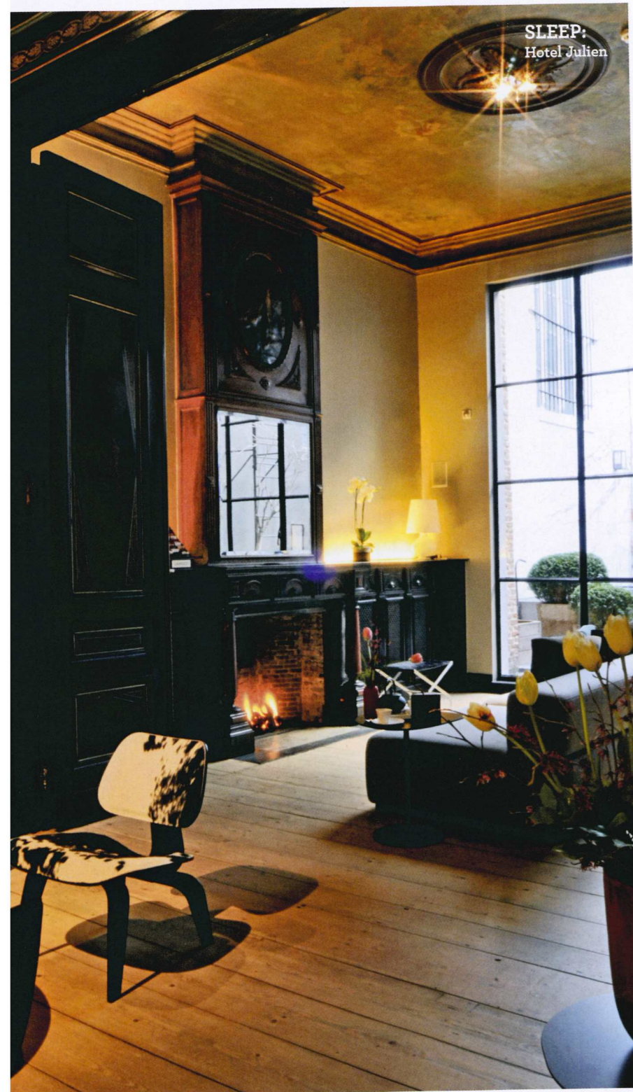
SLEEP: Hotel Julien